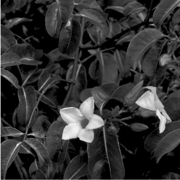
Fig 1. Photograph of C. grandiflora

Its many stems intertwine with each other, or with a host plant allowing it to climb high and form large thickets. This plant is also able to spread rapidly, growing up to 5 meters a month in the rainy season, and release a great amount of seeds at once (Burg et al., 2012 ; Cordon di San Fransisco). It is quite hardy and stress tolerant, able to grow in a very wide range of soil conditions. C. grandiflora is invasive in many semi arid to arid parts of the world, including but not limited to Australia, Ethiopia, Mexico, the United States and the Caribbean (Burg et al., 2012, Luizza et al., 2016 ; Rodríguez-Estrella, 2010). It is quite problematic in all of these areas. It is known for forming large thickets covering all vegetation, reducing accessible sunlight (Luizza et al., 2016). C. grandiflora can also quickly outcompete natives and form monospecific stands especially in riparian areas, as it has been observed in Baja California, Mexico (Rodríguez-